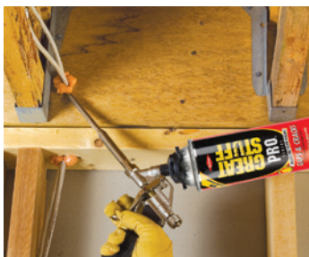
Electrical wire penetrations

Use GREAT STUFF PRO™ Gaps & Cracks Insulating Foam Sealant to seal and insulate around common areas of energy loss such as foundation/sill plate, outdoor fixtures, pipe penetrations, attic and more. 1