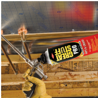
Gas line penetrations