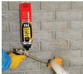
Plumbing and pipe penetrations